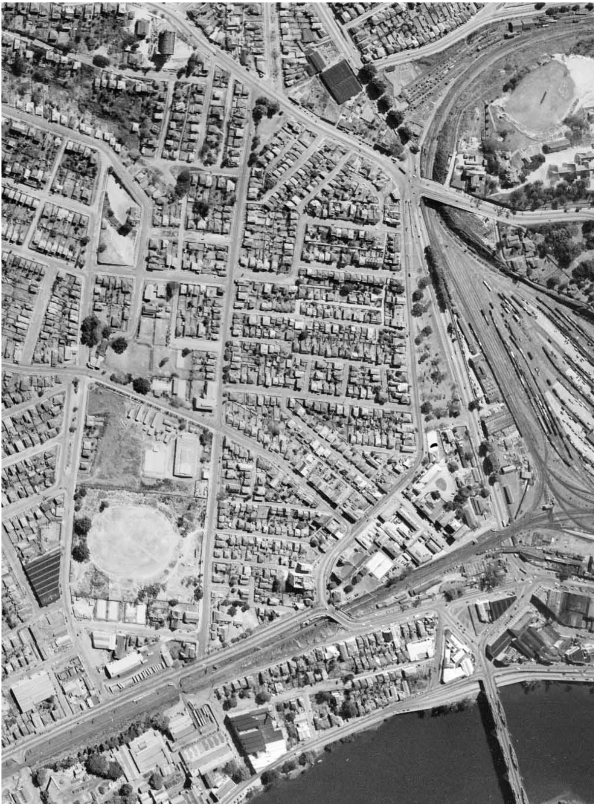
1951 Part aerial photograph BCC 000539333