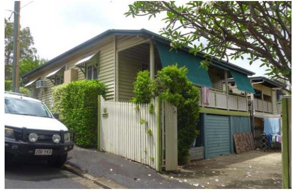
c1983 and 2023 Images of No 14 Pratten Street

We have included this house for no reason other than it has us somewhat confused. All the external clues suggest it fronts and should be addressed as Shannon Street. The 1927 Metropolitan Water Supply and Sewerage Plan below has No 14 oriented north-south on a large corner block. By 1961 the block had been subdivided to accommodate No 4 Shannon Street. The two houses appear to be of the same era, or perhaps No 14 was rotated and shifted on the block, which could explain its address