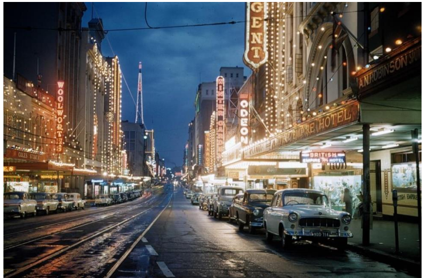
Queen Street 1959 SLQ Rec No 260743

New Farm Cinema 701 Brunswick Street New Farm QLD 4005